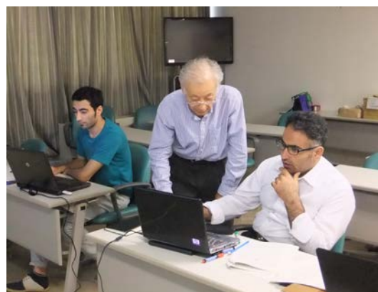
SMS Training held in Tsukuba, Japan

2. Training for Subject Matter Specialists (SMS) on Statistical Analysis and Processing were held in Tsukuba, Japan from 11th to 13th Aug. We invited PEACE and SATREPS students studying in Japan to this intensive training course for statistical analysis and processing using MS Excel so that they can apply statistical skills to their research. Skills for statistical analysis are useful for all agricultural researchers regardless of their specialized fields. The training course was only two and a half day long. Thus participants received some preparation materials prior to attending this course so that they understood the lecture better and spend more time on practices. It is our sincere hope that all the participants who received this training will utilize the skills in their research activities.