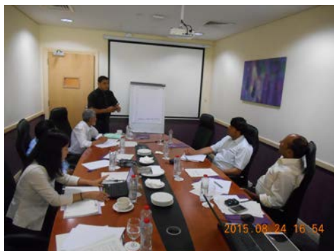
Meeting in Dubai

Participants from Afghanistan prepared presentation on their research activities to discuss the problems they are facing. Some important issues were addressed during the meeting which CDIS-Output3 must consider the solutions when drafting the institutional strengthening plan.