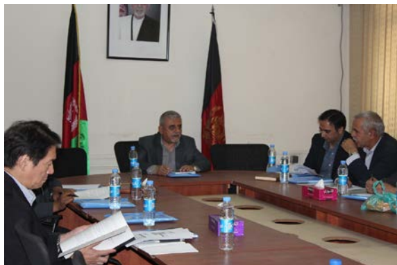
Deputy Minister for Agricultural Affairs, MAIL (Chair person of JTCCG)