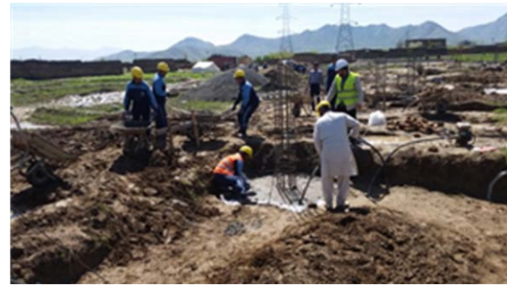
Progress on curing the concrete footing of the building