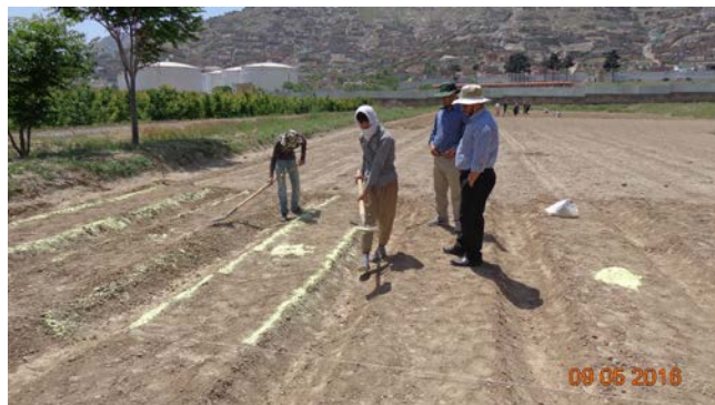
Land preparation for vegetable plot

1. New Fiscal Year has started and CDIS-Output3 is now preparing experimental plots in Badan Bagh Experimental Station. This year, we are aiming to develop research capacity by monitoring the experiments listed below. CDIS-Output3 will encourage researchers to implement activities according to the PDCA cycle, which means Plan, Do, Check and Act (take action on the issues found while checking). By repeating the PDCA cycle, researchers can improve their research implementation capacity and the quality of their research outcomes. Japanese experts are ready to provide supervision to the research activities, so timely communication is vital in order to improve the research implementation and management skills. Most of our experimental plots are already prepared for the crops and some of the experiments have already started.