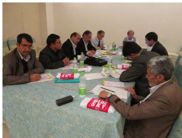
Meeting in Delhi, India