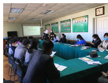
Conference hall of Food and Agriculture Department of Darkhan-Uul Province

In accordance with the “General Guidelines for Veterinary Services and Hygiene Requirements for Beekeeping”, which was approved by the General Authority for Veterinary Services in 2020, the veterinary certificate is given to honey based on the beekeepers self-control on their honey production followed by the veterinary inspection. On the other hand, the JICA Project for Formulation of Master Plan on the Agricultural Value Chain in Mongolia (MONMAP-AVC) has been developing a honey tracking system, and it launched pilot activities in March. The MONMAP-AVC and the RDC jointly organized training, including the topics on the use of the above general guidelines and the tracking system, and provided veterinarians with basic knowledge of beekeeping.